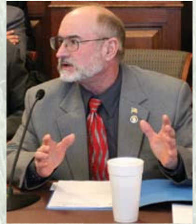
Sen. Munzlinger presented Senate Bill 16 to the Senate Agriculture, Food Production and Outdoor Resources Committee on Jan. 23, 2013.

The new law will take effect on Aug. 28, 2013.