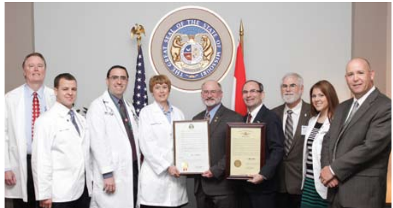
Osteopathic students from ATSU visited the Capitol on April 27, 2013.